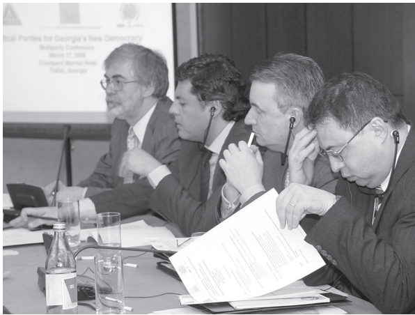
Multiparty Conference. March 17, 2006

product of the first stage of the project – was published in 2006 in the Georgian and English languages and presented to Georgian and international audiences. The book's presentations were organized as side events during the meeting of the Steering Committee of the World Movement of Democracy in The Hague (October 2006) and the OSCE Supplementary Human Dimension Meeting in November 2006 in Vienna. In April of that same year, based on the results of the research, NIMD and CIPDD co-organized a workshop entitled Interactive Assessment of Political Organizations: Example of Georgia , within the framework of the Fourth Assembly of the World Movement for Democracy in Istanbul, Turkey.