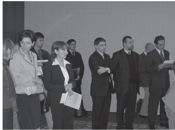
Presenting CIPDD publication - Taking Stock: Small Arms and Human Security in Georgia . October 17, 2006

The project “Mapping of the National Integrity System in Georgia”, which began