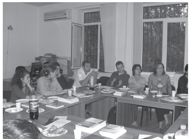
Discussion with students. October 11, 2006

In 2006 CIPDD focused its work on developing tools for reaching out to its audiences