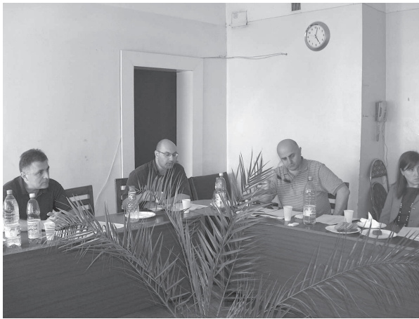
CIPDD board meeting