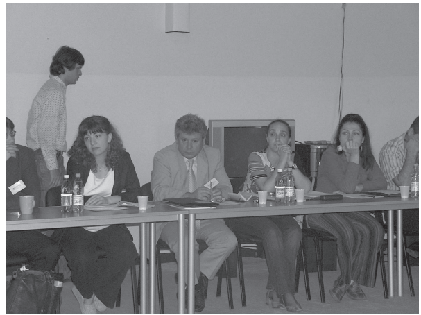
Workshop - How to Advance Religious Pluralism through Civic Education. June 9-11, 2006

The first project lasted three years and ended in 2006. This three-year research on country's religious problems revealed a wide diversity of opinions and a very low level of religious tolerance in Georgian society. The project showed that the situation of religious minorities was much worse in the regions than in the capital. However, religious discrimination and violence have become less visible since the November 2003 revolution.