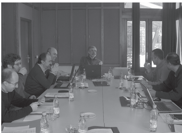
Authors' meeting: 10 questions on political development of Georgia. December 8-9, 2006

The political forum “Ten Questions on Georgia’s Political Development” was organized with the participation of leading Georgian political analysts. The participating analysts were asked to sum up main